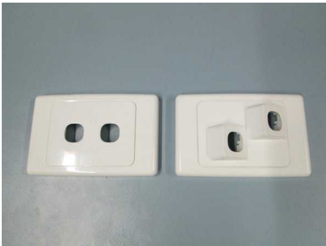
Figure Faceplates for Telecommunications Outlets-2: Faceplates for telecommunications outlets

Quad plates are not allowed because there isn't enough room on them to fit our required labelling. Only use singles, duals and triples.